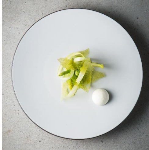
Gregory CZARNECKI Waterkloof South Africa

« With its minimalist and daring design, the Revol collection perfectly blends in with my approach. »