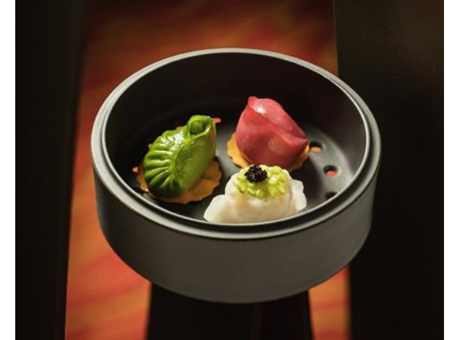
Calvin SOH City of Dreams Macau

« It's important for me to always embellish my creations with a note of boldness. Working with shapes, textures and colours of the Equinox collection is an invitation to play with contrasts. »