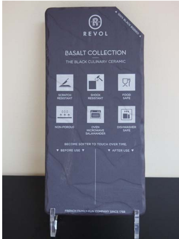
Basalt ceramic shelf talker + plexi holder 654149