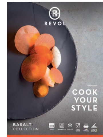
SHELF TALKER Ref 652517